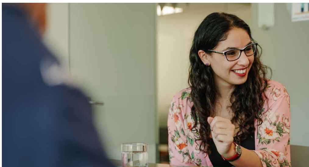
Tresmontes Lucchetti business employee, Chile

extraordinary meeting on April 21, 2022, with the aim of deciding on the authorization required by several Board members due to potential conflicts of interest regarding the deliberations and decisions on the third tender offer for common shares of Grupo Sura S. A.