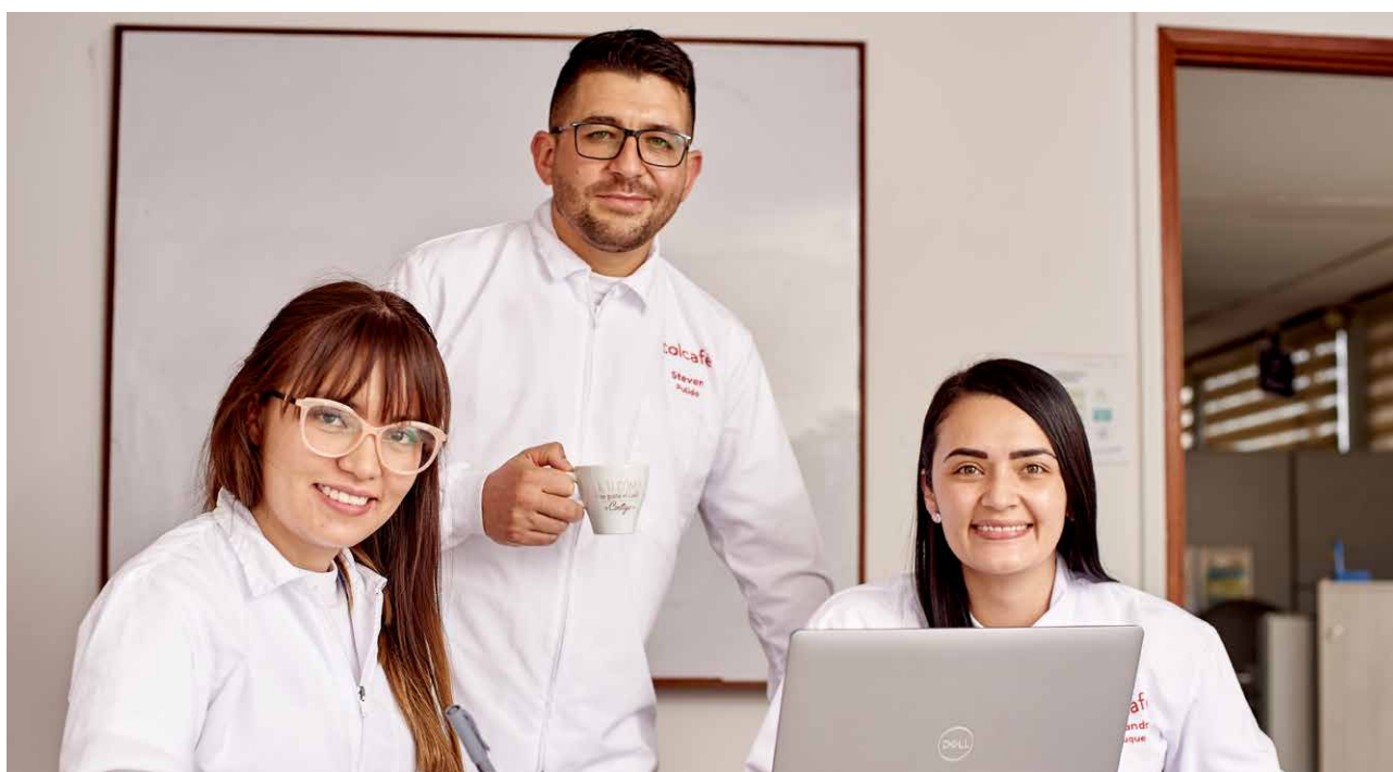
Coffee business employees, Colombia.