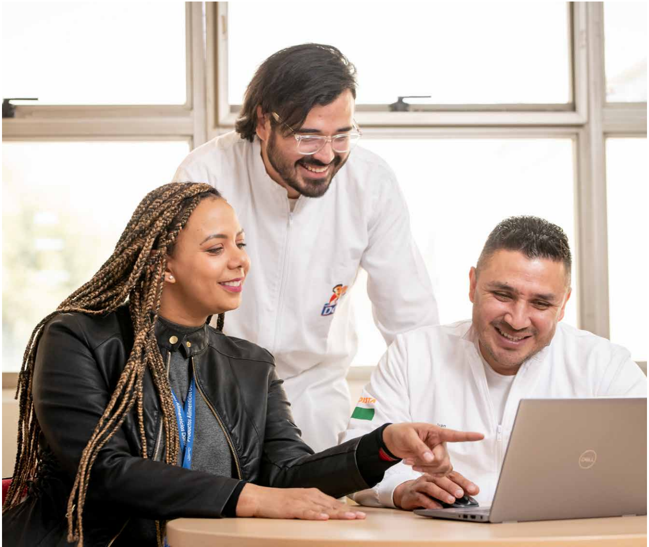
Pasta business employee, Colombia.

One of the priorities of Grupo Nutresa (hereinafter the Company, the Business, the Organization or Grupo Nutresa) is to ensure that the Company's actions, as well as those of its governance bodies, are carried out within an institutional and ethics-based framework, focusing on transparency and integrity. Therefore, corporate governance is one of the pillars of the Organization's philosophy and corporate actions.