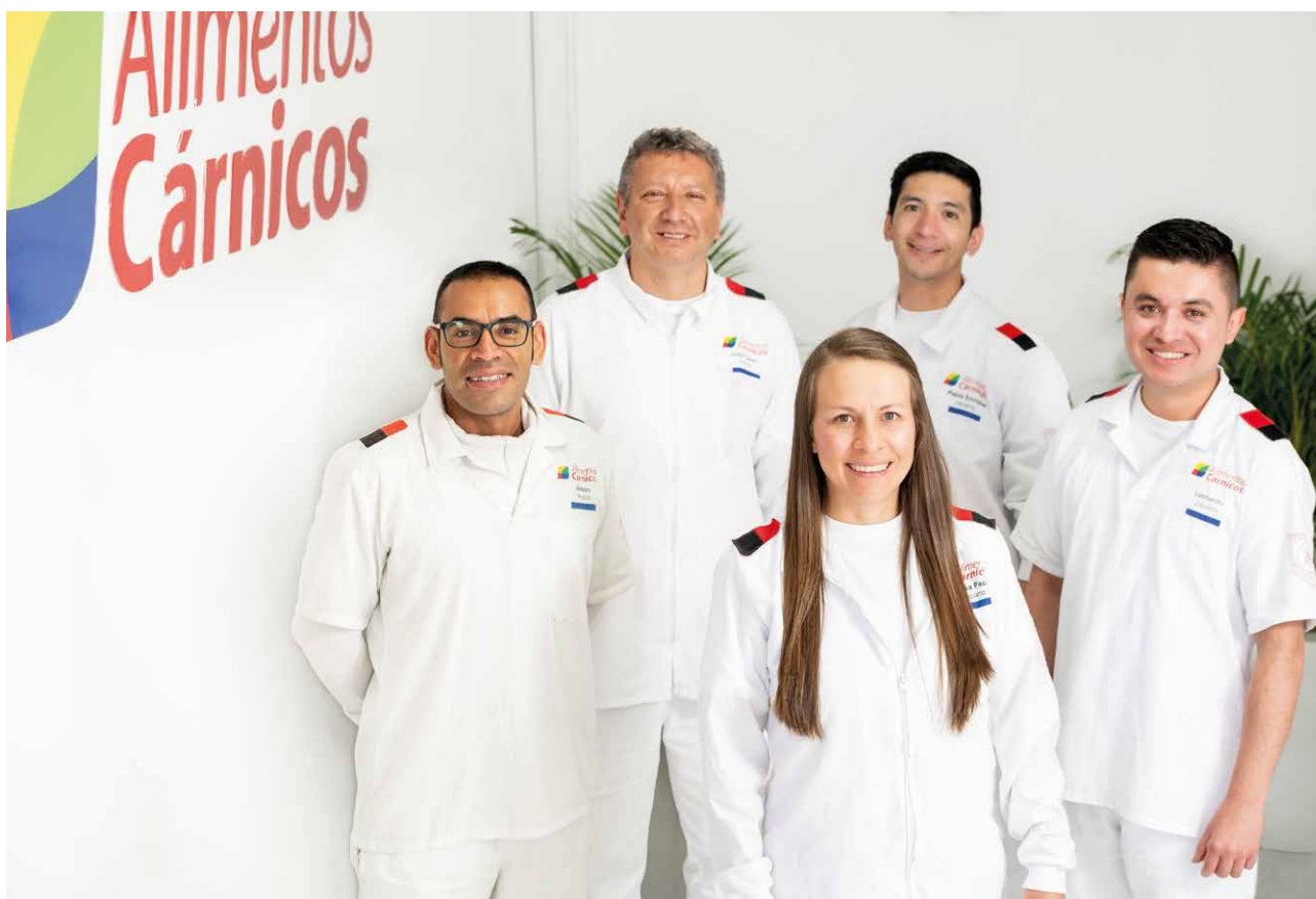
Cold cuts business employees

The methodology comprises the stages for establishing the context, identification, analysis, assessment and addressing of current and emerging risks through efficient and sustainable measures. The purpose of these stages is to prevent the risk events from occurring and, in case of materialization, to mitigate the possible negative impact on the environment and the Organization's human, financial, reputational and information resources, thus allowing to ensure the continuity of its operations.