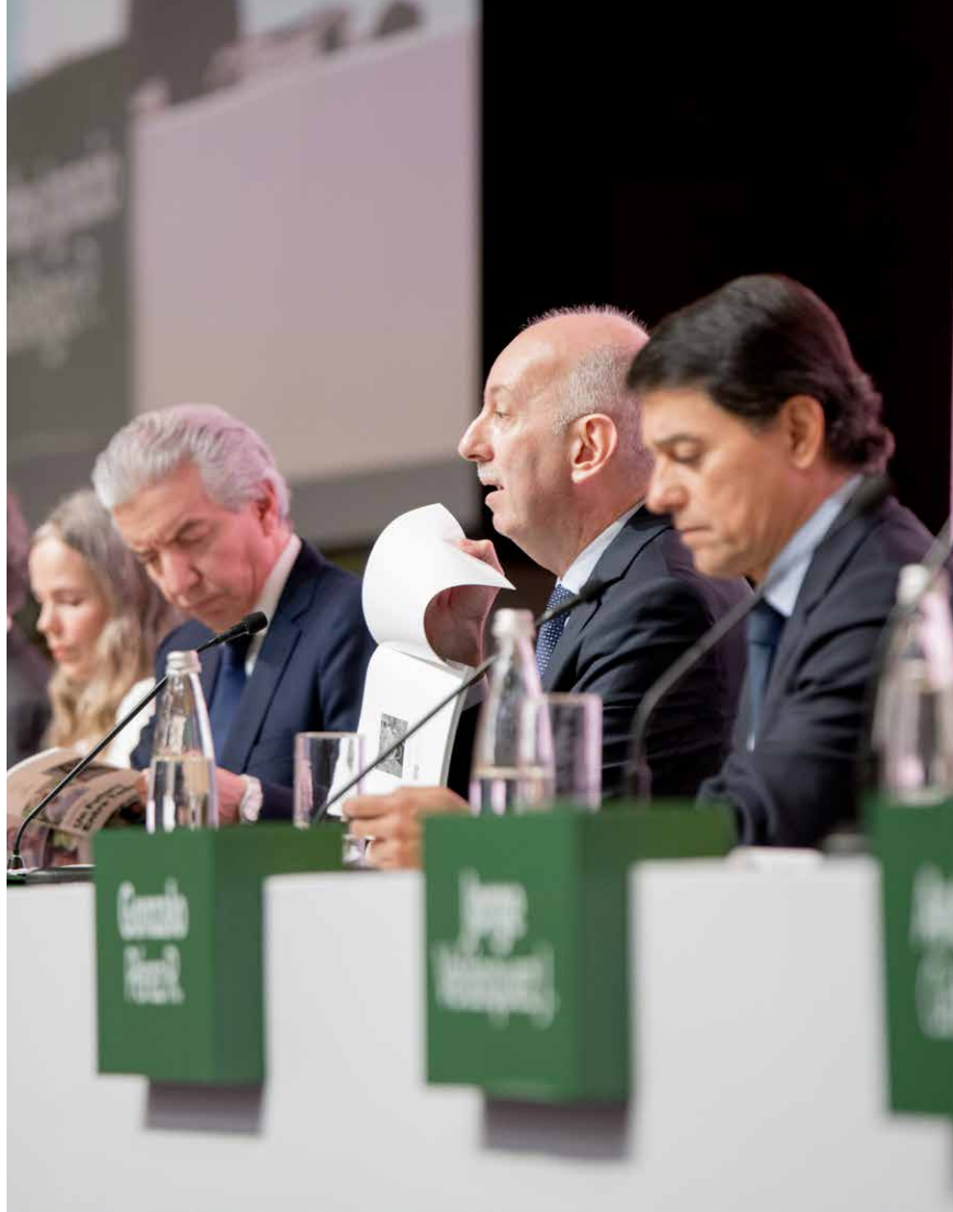
General shareholders' assembly, 2022.

The Assembly approved the statutory amendment regarding the reduction of the number of Board members from 8 to 7, and the Board of Directors was rearranged with 7 members, reelecting the following Board members for the remaining statutory term of the Board, that is, from January 4 to March 31, 2022: