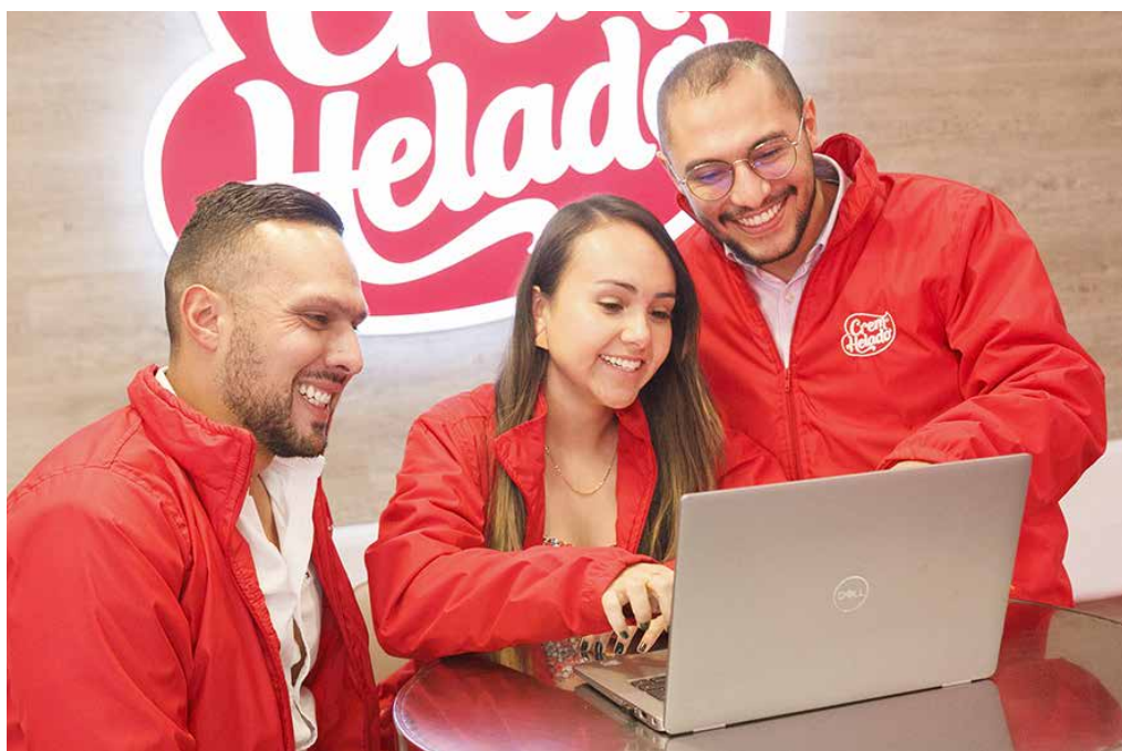
Ice cream business employees, Colombia