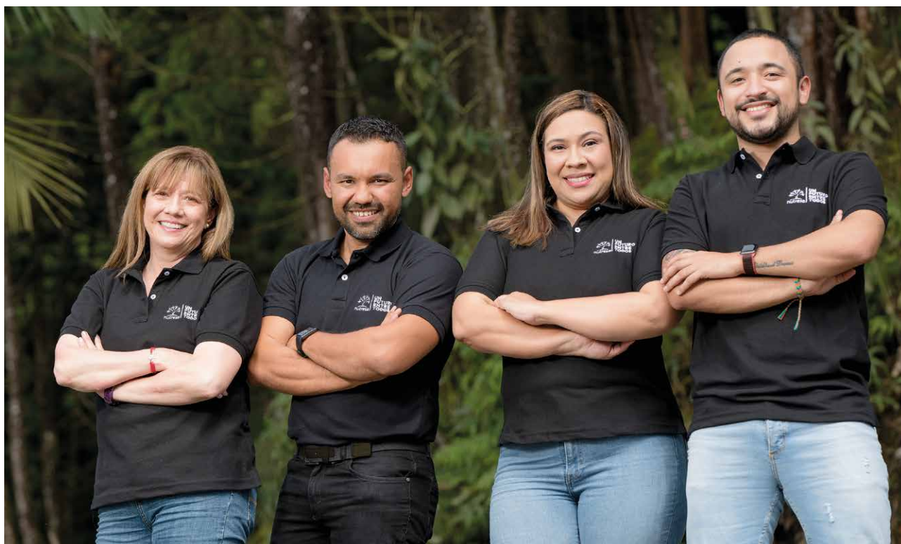
Fundación Nutresa employees, Colombia